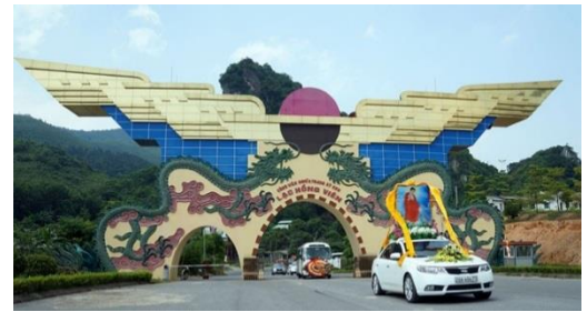
The view of Lac Hong Vien